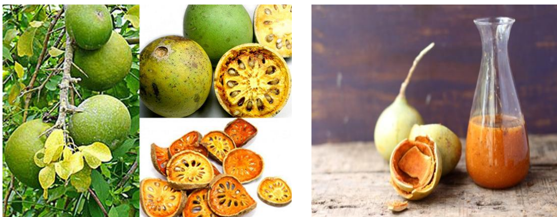
Figure 3. Bael Fruit and Juice.

It is also known by various names such as Wood apple, Kaitha, Maredu Pandu, Vilam Palam, Baelada Hannu, Koovalam, Kothu, Koth Bael, etc. (Roytman. Et al., 2014). It's one of the few Ayurvedic plants whose entire parts from root to leaves are used for different diseases. The fruit balances Kaph and Vata doshas, its roots improve digestion, leaves are good for pain, stem for heart and Bael flower's for curing of diarrhea. Bael juice is useful in curing of constipation because of its laxative properties. (Bakhru, 1995) Bael juice gives great comfort in heartburn, acidity, hyperacidity and indigestion.