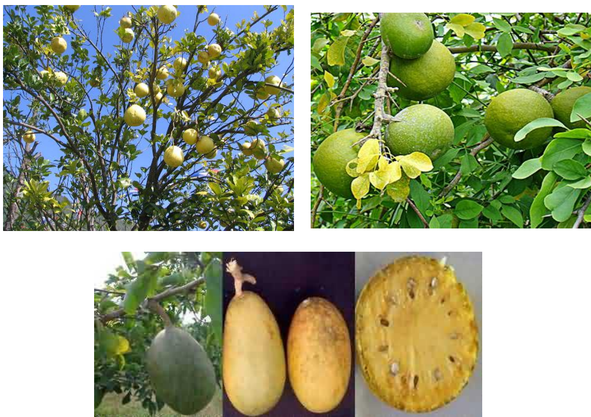
Figure 1. Bael Tree and Fruits.

Bael, also known as the “Wood Apple”, is a species native to India. The bael tree is considered to be sacred to the Hindus. A famous drink known as sherbet is made from the bael fruit and it has been known for its medicinal values since 2000 BC. Here in this post you will know about various benefits of bael fruit. The local names of bael fruit are ‘Kaitha’ in Hindi, ‘Maredu Pandu’ in Telugu, ‘Vilam Palam’ in Tamil, ‘Baelada Hannu’ in Kannada, ‘Koovalam’ in Malayalam, ‘Kothu’ in Gujarati, ‘Kavath’ in Marathi and ‘Koth Bael’ in Bengali.